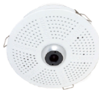
c26 with lens B036