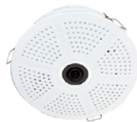
c26 with lens B016