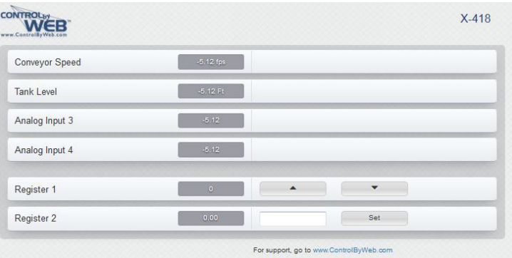
Example X-418 Control Page